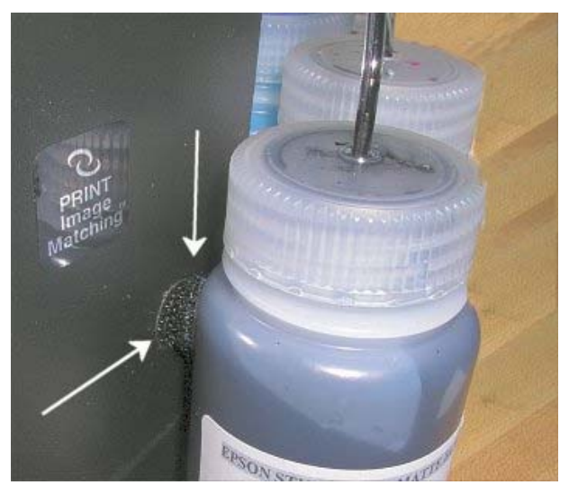
Velcro attaches bottles to printer (This is photo from a 2200 printer)

Hold the tube against the outside of the ink bottle. Cut off the excess tube at a 45 degree angle. Insert the tube into the bottle. Make sure that you insert 3 \frac{1}{2} to 4 inches of tube length into the center hole in the bottle cap. This will put the end of the tube on the bottlom of the bottle. Put a little alcohol on the tube so it slips through the center hole in the bottle cap.